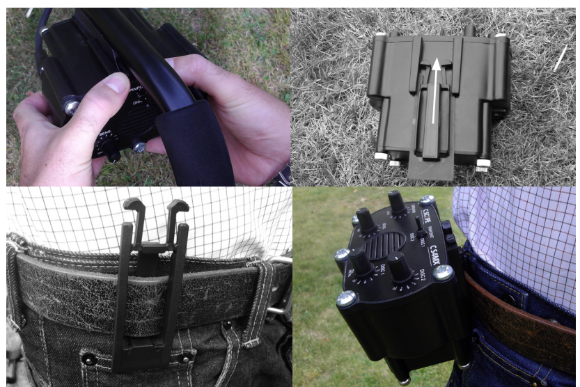
Above: Slide the belt mounting clip into the fixing slots on the underside of the control box and push all the way until the retaining lugs click into position.

Squeeze the control box retaining clips together using your thumbs as shown in the photograph. The control box will now slide towards you free of the control box mounting clip. The control box can be fitted to your belt using the clip provided. In belt mounted use, be sure to wind the search-head cable up the stem at least to the length adjuster and secure it with tape or cable tie. This is because the lead will be detected like a target if it is left free to move.