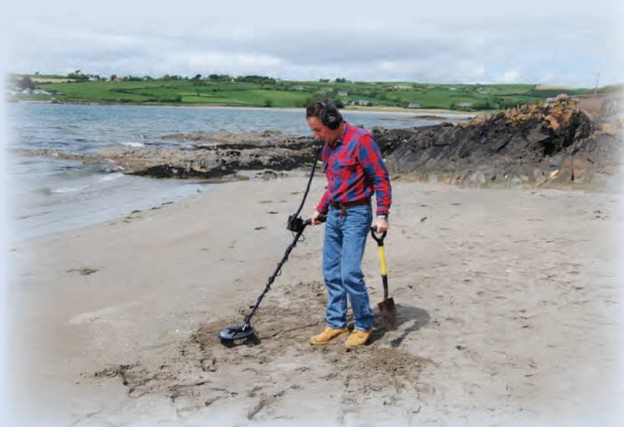
The author detecting on the beach.