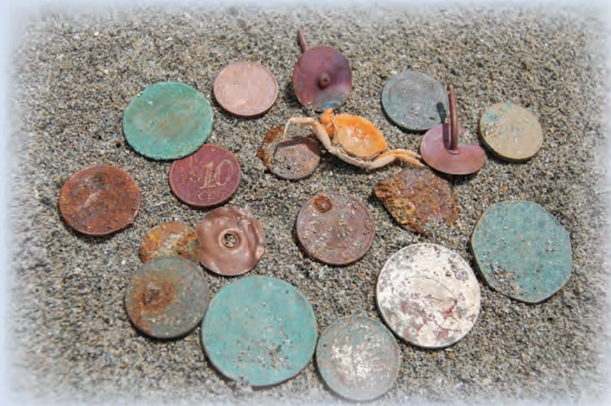
Small coins and rivets.

were further apart. A large signal gave up an old pre-decimal copper penny. More coins followed that were nearly all small rusted blobs. These are current 'copper coins' that can confuse a novice due to the fact they are not copper at all but copper coated with an iron core inside! It is that iron core that corrodes from the inside out.