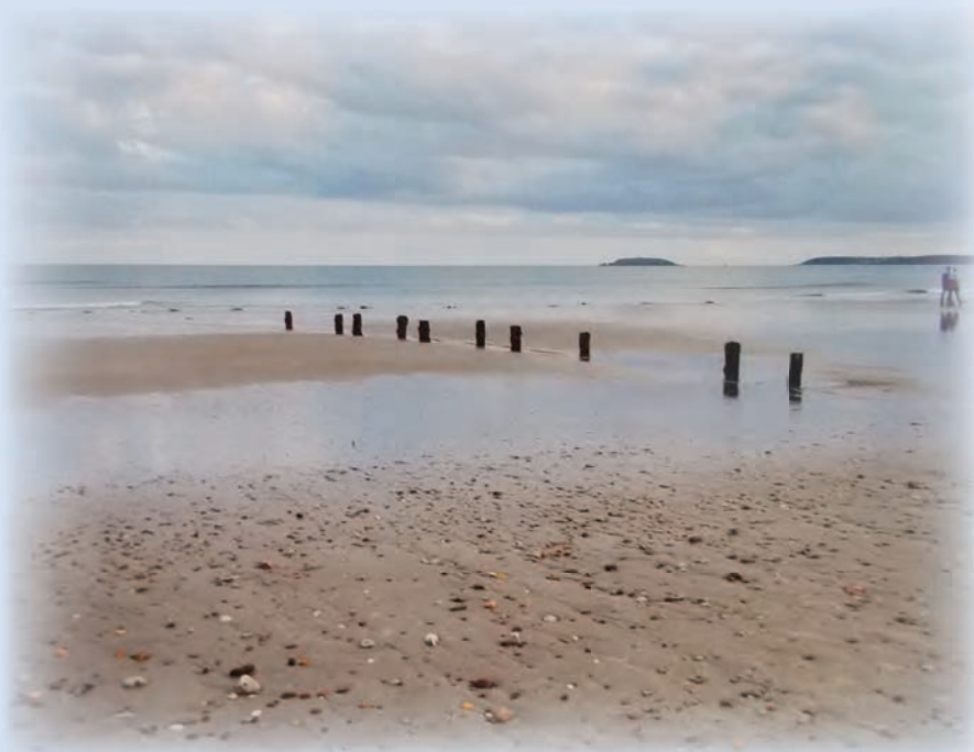
Wet sands between groins.