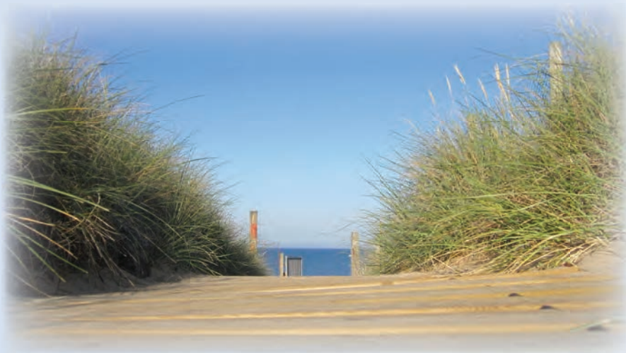
This way to the beach....

On deeper targets the effect wasn't as noticeable with the 'decay' of the signal dying away quicker than with the shallow ones. One memorable find was deep and consisted of a car cigarette lighter! Checking another signal next to it resulted in a small ball towing hitch. I'm still looking for the rest of the car!