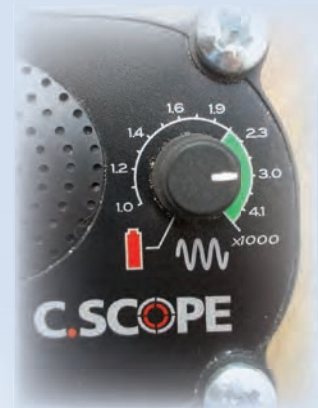
Pulse frequency control set at 3.

within the 'PI' world, including some collaborations with C.Scope and others. I had the pleasure of meeting Eric at a rally years ago.